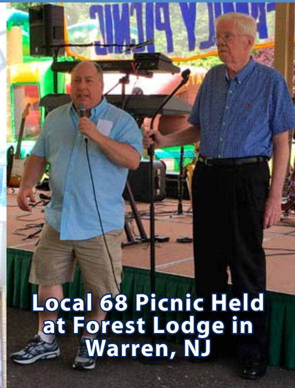
Local 68 Picnic Held at Forest Lodge in Warren, NJ