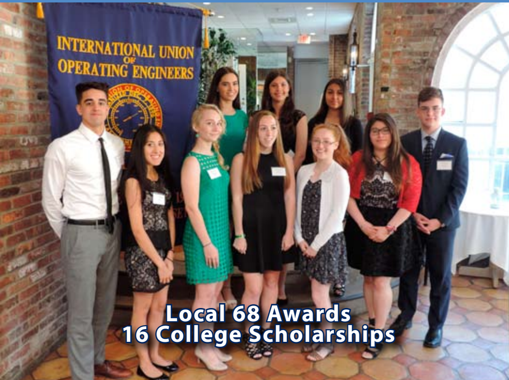
Local 68 Awards 16 College Scholarships