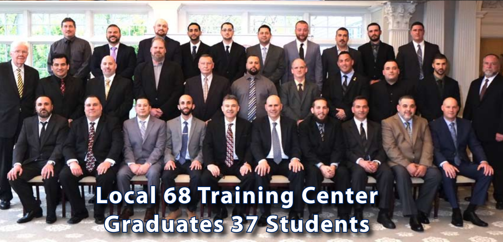
Local 68 Training Center Graduates 37 Students

Local 68/68A/68B International Union of Operating Engineers Education Fund